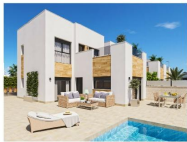
PROMOCIÓN 4 VIVIENDAS CON PISCINA